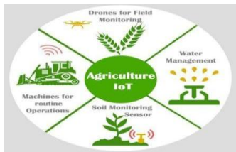
Figure 2 Smart Agriculture using IoT

As a result of the soil moisture technology, water usage may be improved by providing comprehensive and accurate information on local supply and references in the season. One of the most popular, cloud-based, and strong cloud-based positions for advisers and things that assist plants to develop to take advantage of the aids in high-quality crop watering or washing with water via a simplified connection is the virtual enhance PRO.