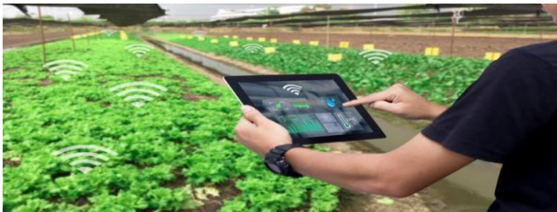
Figure 5 Livestock Monitoring

Drones can monitor grazing cows, bulls, and other agricultural animals, reducing the need for humans to monitor them. Drones may use thermal sensing technology to locate agricultural animals that have gone missing, as well as to determine the precise number of animals that have been injured or are ill. Drones are more capable of producing superior cattle, such as cows and bulls, than humans ever could.