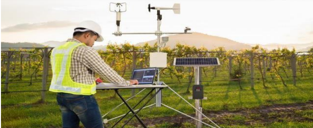
Figure 4 Crop Surveillance

health of crops in a specific region and identify which in broad areas without having to assume about the general health of crops. Drone mapping allows farmers to keep tabs on the health of their plants in a specific region and pinpoint which parts of the field need extra care. Using infrared cameras and light mental concentration/picking up of liquid rate, drones study the field to make educated guesses about crop health. Farmers in any place may take action to enhance the health of their plants if they are given accurate information that is occurring or can be seen right now.