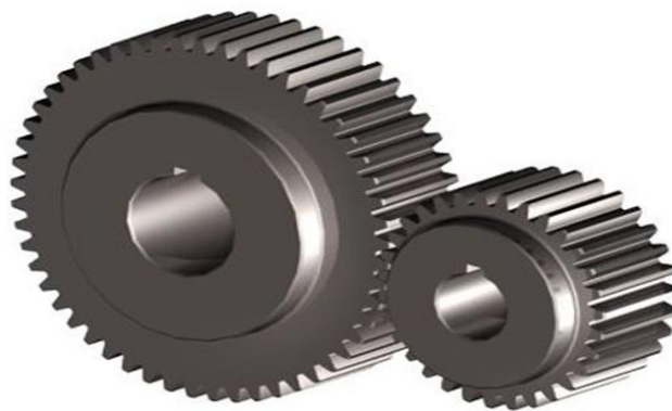
Fig.04 (Spur gear)

types of gears available in the market but spur gear is the most commonly used type of gear.