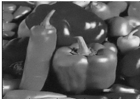
Fig 3: complex wavelet denoising