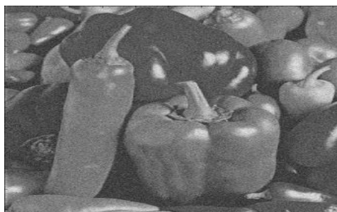
Figure 2: The original image

This section talks about the results obtained in the proposed method. Figure 2 shows the original image. Fig 3 shows the complex wavelet denoising and Fig 4 shows Sobel operator image.